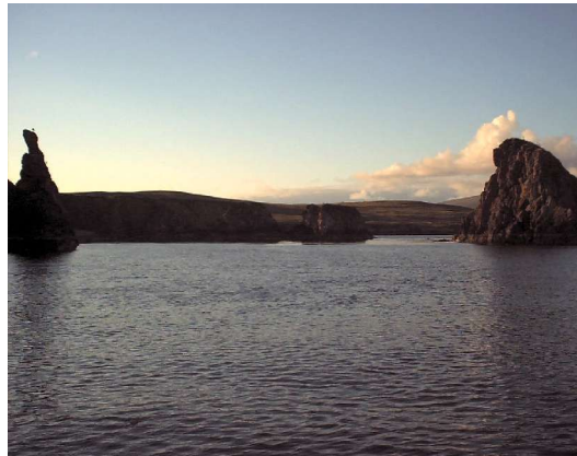
Off Hillswick Ness

Nature plays a big part in Shetland, the wide-open spaces and pristine beaches make for a holiday that is second to none for getting close to nature. Probably the most popular reason for visitors to come to Shetland is for the bird watching. Over 40 different species of birds have been spotted from the windows of Nye Swarthoull as have otters playing in the sea. Close to Swarthoull are the Eshaness Cliffs and the Ness of Hillswick. Both of which have large populations of nesting sea birds.